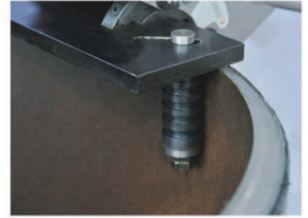
Inside Idler Pulley