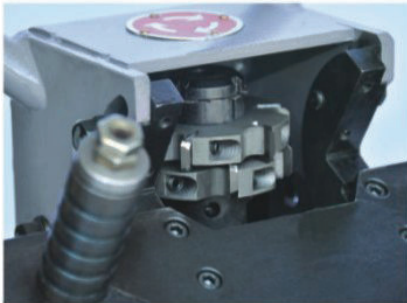
Double-butterfly Shape Cutter Head