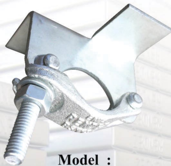
Model : RBRC-G-486 ( For SS280 Standard )