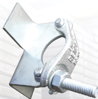
Model : RBRC-AS-486 ( For AS1577 Standard )